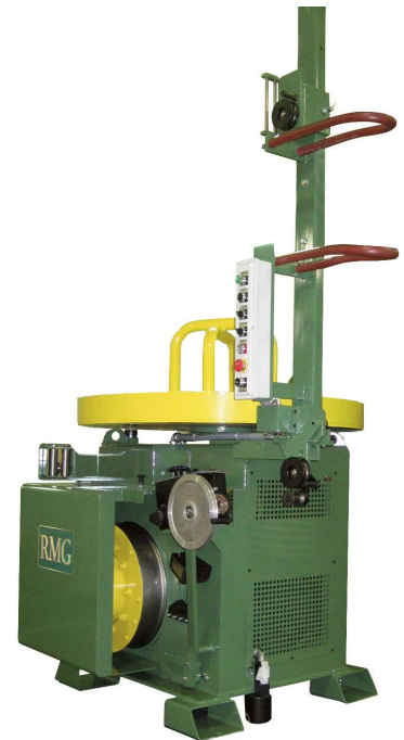
RMG Model 500SS