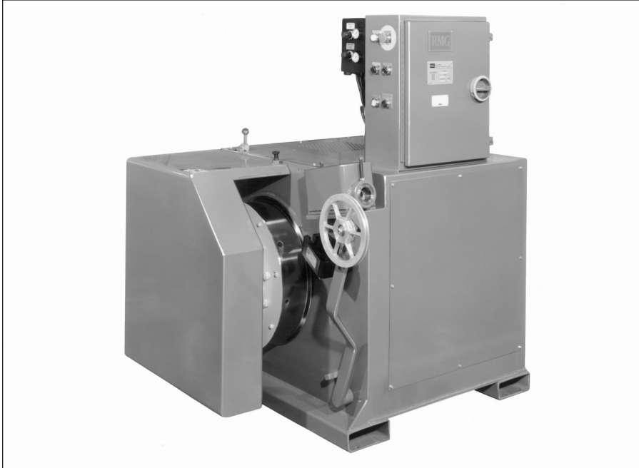
RMG Model 67 In-Line Wire Drawing Machine; shown with standard full capstan cover.