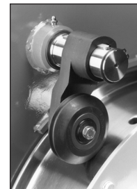
4" Pneumatic Single Wire-Relaxer is standard on 15+ hp Model 67 and all Model 78 machines.