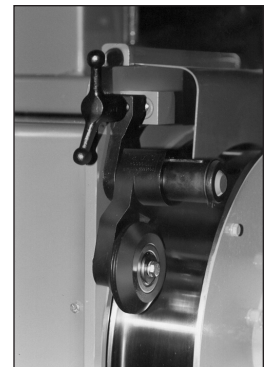
4" Manual spring-loaded Wire-Relaxer Roller is standard on 2, 3, 5 and 7 hp Model 56 machines.