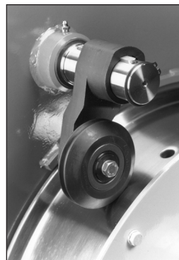
Pneumatic Single Wire-Relaxer is optional on 10 hp; standard on 15 & 20 hp Model 56 machines.