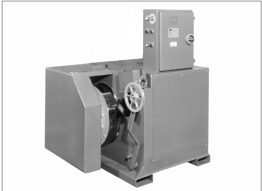
RMG Model 56 In-Line Wire Drawing Machine; shown with standard full capstan cover.

All Spacesaver versions include the TANGLEGARD snag detection system.