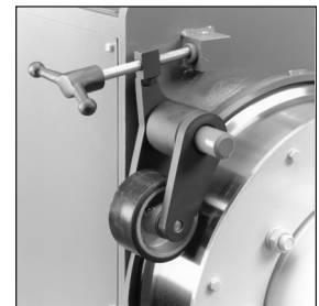
Manual Clamp Roller is standard on all Model 23 wire drawers.

Please refer to page 2.4 and 2.5 in this section for a detailed description of all RMG In-Line Wire Processing machine components.