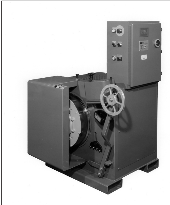
RMG Model 34 In-Line Wire Drawing Machine; shown with standard full capstan cover.