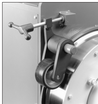
Manual Clamp Roller is standard on all Model 12 wire drawers.

The RMG Model 12 Wire Drawer is available in the Spacesaver configuration which provides an integral turntable on top of the machine. All Spacesaver versions include the TANGLEGARD snag detection system.